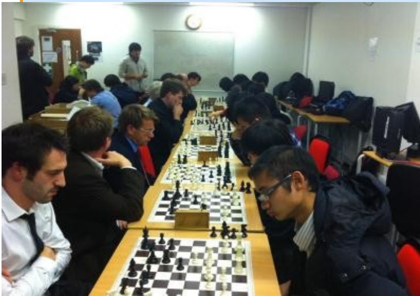
Above: The Tournament in full flow. Below: A trip to remember

The tournament will be concluded in the final chess club of the year on Thursday 8th December. Good luck all!