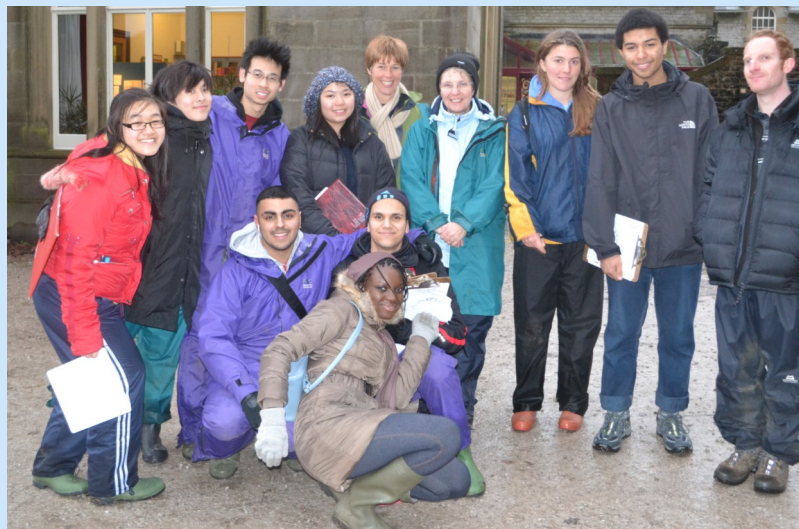
The Group at Malham Tam Field

Our Abbey College Cambridge Biology class was very fortunate to have visited Malham Tarn Field Centre. Being so close to nature and learning in this environment gave us a better insight into our current work and broadened our horizons. Our days were packed with lessons which were very interesting and took place outside more than in the classrooms. Doing a lot of practical work also helped us understand some practical aspects of ecology which we had met before but only in theory, such as sampling techniques. Carrying them out in the field was more fun but it also helped us see real concerns of each sampling method which ecologists face. It proved to be very good prac-